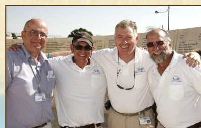
MM Tour Guides