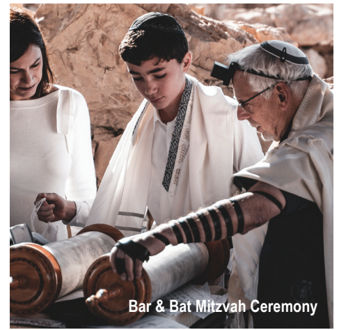
Bar & Bat Mitzvah Ceremony